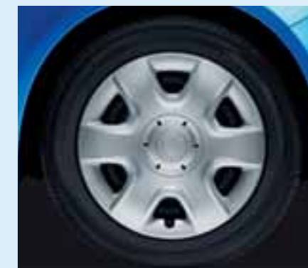
6.0J x 15" steel wheels for 195/55 R15 tyres with Hermes hub covers.