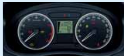
Instrument panel with on-board computer