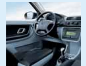
Floss interior – leather/artificial leather/fabric

Steering wheels in the pictured interiors are illustrative only. The up-to-date offering can be found on page 28.