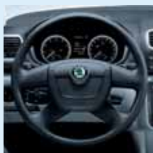
4-spoke steering wheel