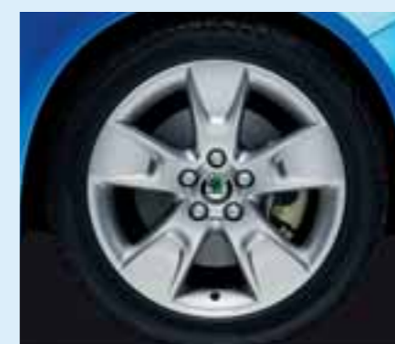
6.5J x 16" Bear alloy wheels for 205/45 R16 tyres.