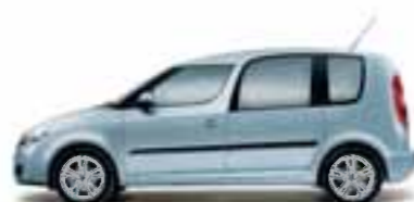
Aqua Blue metallic