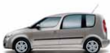
Cappuccino Beige metallic