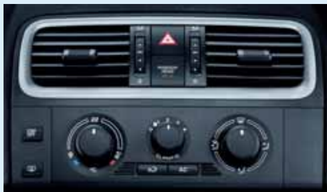
Climatic – air conditioning with automatic regulation and combi filter: automatic maintenance of preset temperature of the air inflow, manual regulation of air volume and setting of exhaust.