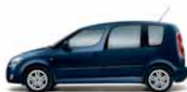
Pacific Blue uni