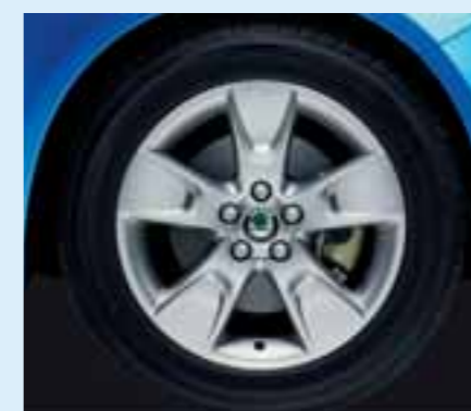
6.0J x 15" Avior alloy wheels for 195/55 R15 tyres.