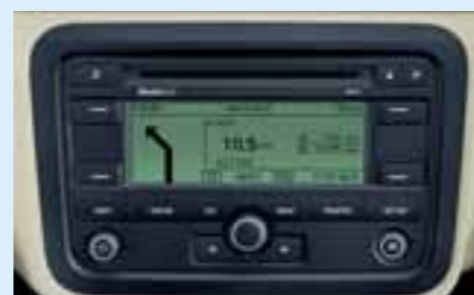
Navigation system with dynamic TMC module: enabling reception of traffic information, RDS-equipped AM/FM receiver, CD and MP3 player, connection to a CD changer, input jack for the mobile phone hands-free set.