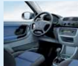
Stone Blue interior (Onyx-Silver-grey dashboard)