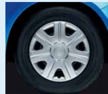
6.0J x 14" steel wheels for 185/60 R14 tyres with Castor hub covers.