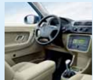
Chic interior (Onyx-Ivory dashboard)