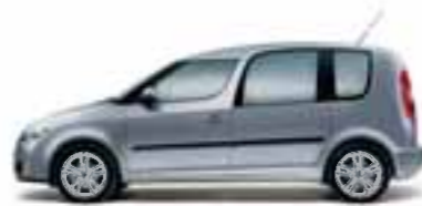
Platin Grey metallic