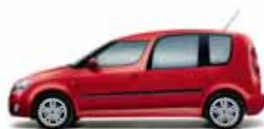
Corrida Red uni