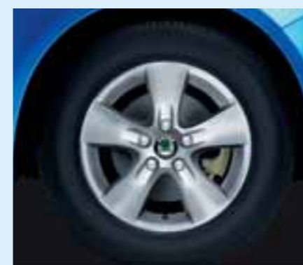
6.0J x 14" Atik alloy wheels for 185/65 R14 tyres.