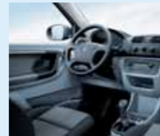
Stone Grey interior (Onyx-Silver-grey dashboard)