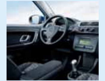
Style Grey interior (Onyx-Onyx dashboard)