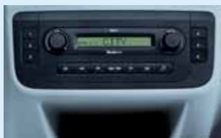
Radio Beat: AM/FM tuner with RDS, electronic encryption limiting the use of the radio to a specific car, CD changer control functions and input jack for the mobile phone hands-free set. Provided with audio jack.