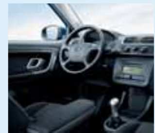
Chic Night interior (Onyx-Onyx dashboard)