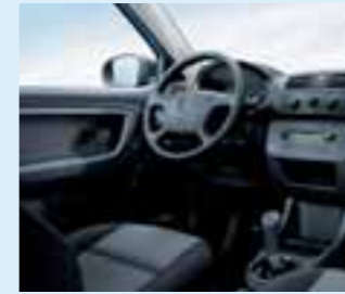
Stone Grey interior (Onyx-Onyx dashboard)