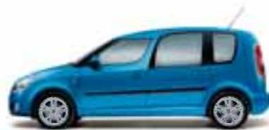
Ocean Blue metallic