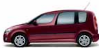
Rosso Brunello metallic