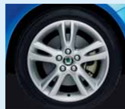
6.5J x 16" Atria alloy wheels for 205/45 R16 tyres.