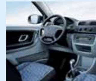
Style Blue interior (Onyx-Silver-grey dashboard)