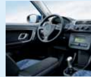
Style Blue interior (Onyx-Onyx dashboard)