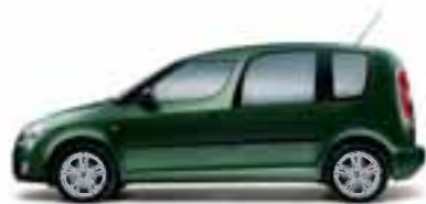
Amazonian Green metallic