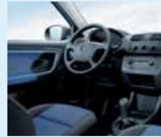
Stone Blue interior (Onyx-Onyx dashboard)