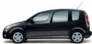
Black Magic pearl effect