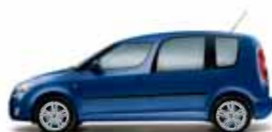
Storm Blue metallic