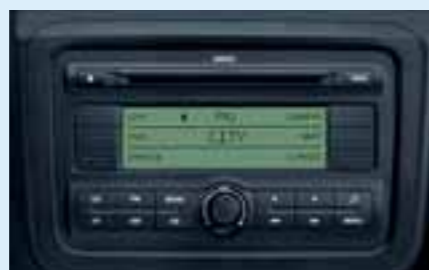
Radio Dance: same as Radio Beat, plus integrated CD and MP3 player, digital signal processor with an equaliser, and a large dot-matrix display conveying messages from the parking sensor. Provided with audio jack.