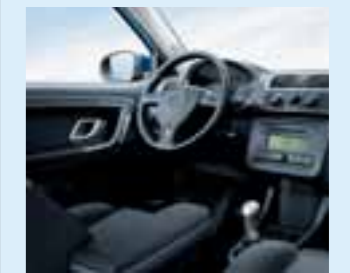
Pulse interior – sports seats