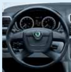
4-spoke leather steering wheel