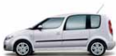
Candy White uni