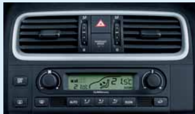
Climatronic – air conditioning with electronic regulation and combi filter: automatic maintenance of interior temperature, automatic regulation.