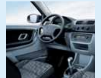
Style Grey interior (Onyx-Silver-grey dashboard)