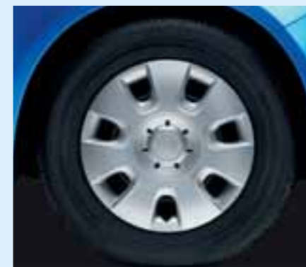
5.0J x 14" steel wheels for 175/70 R14 tyres with Draco hub covers.