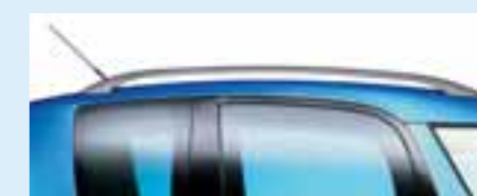
Roof railing (lengthwise), silver.