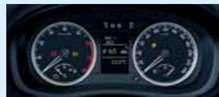
High-line instrument panel with Maxi DOT display