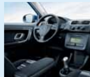
Magic interior (Onyx-Onyx dashboard)