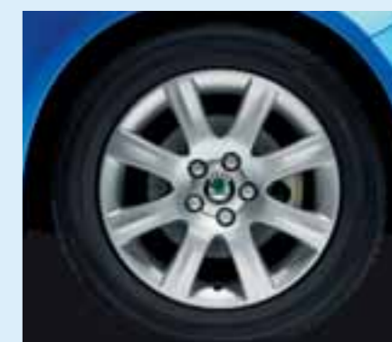
6.0J x 15" Line alloy wheels for 195/55 R15 tyres.