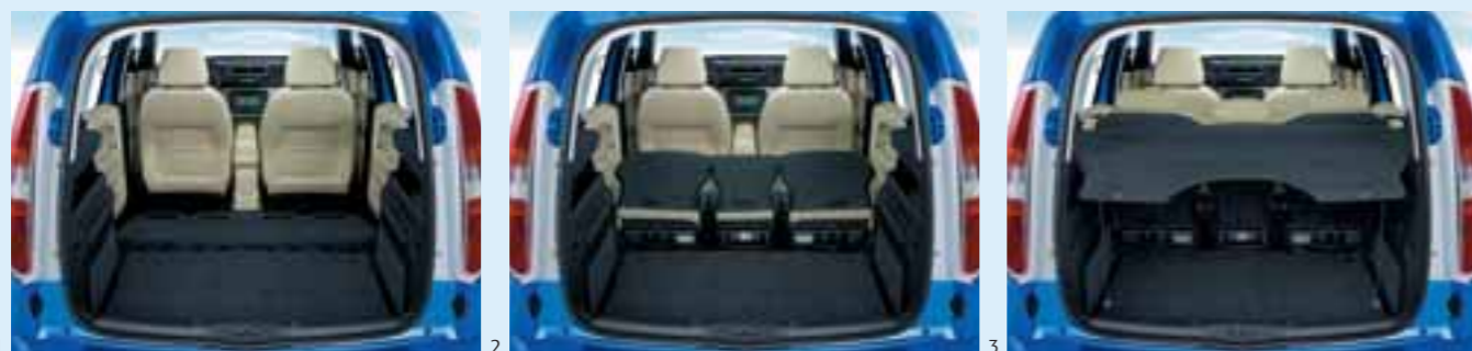
1. 2. 3.