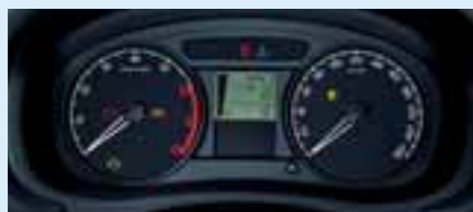
Basic instrument panel