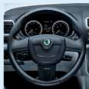
3-spoke sports leather steering wheel